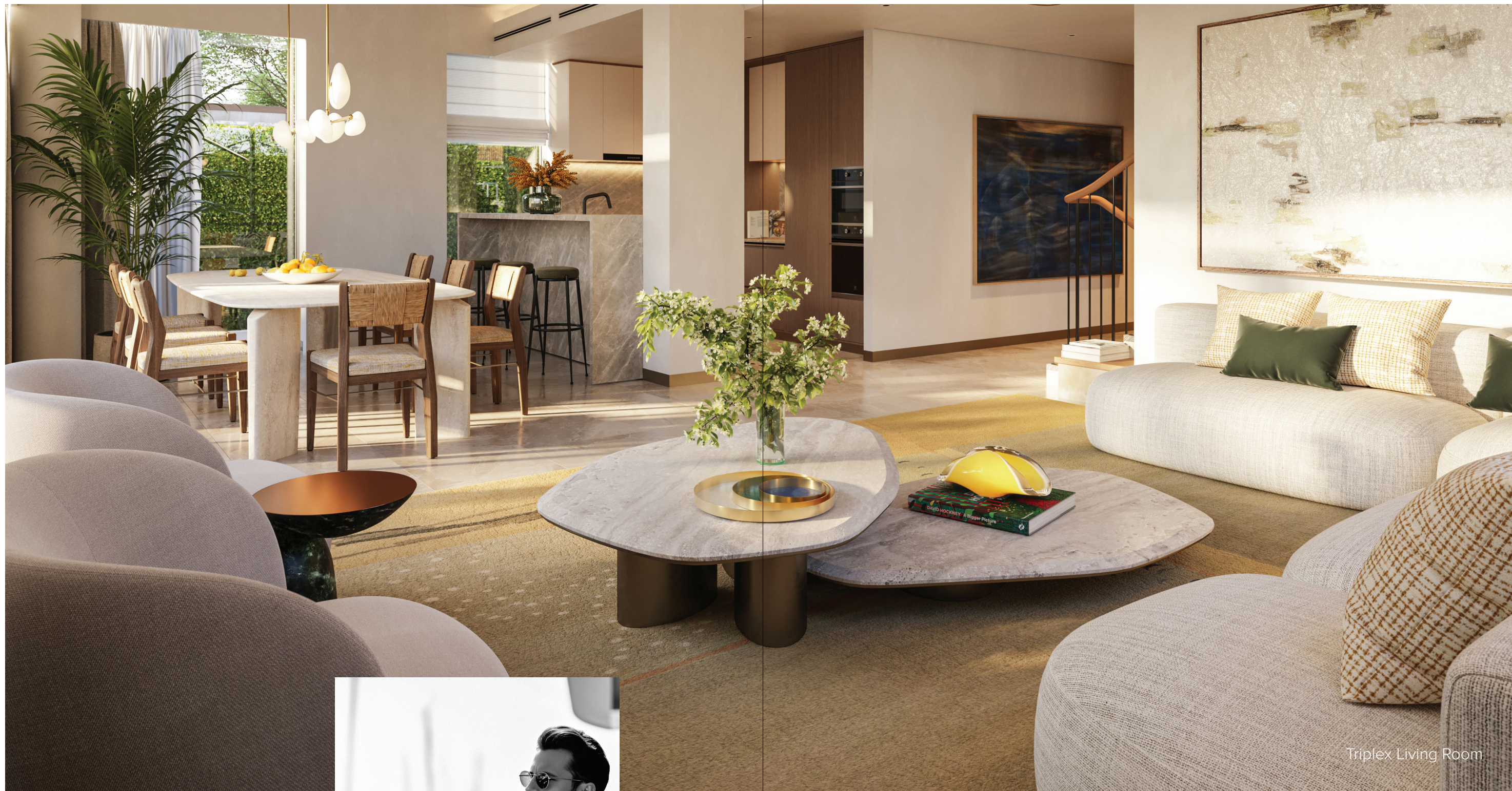
Triplex Living Room