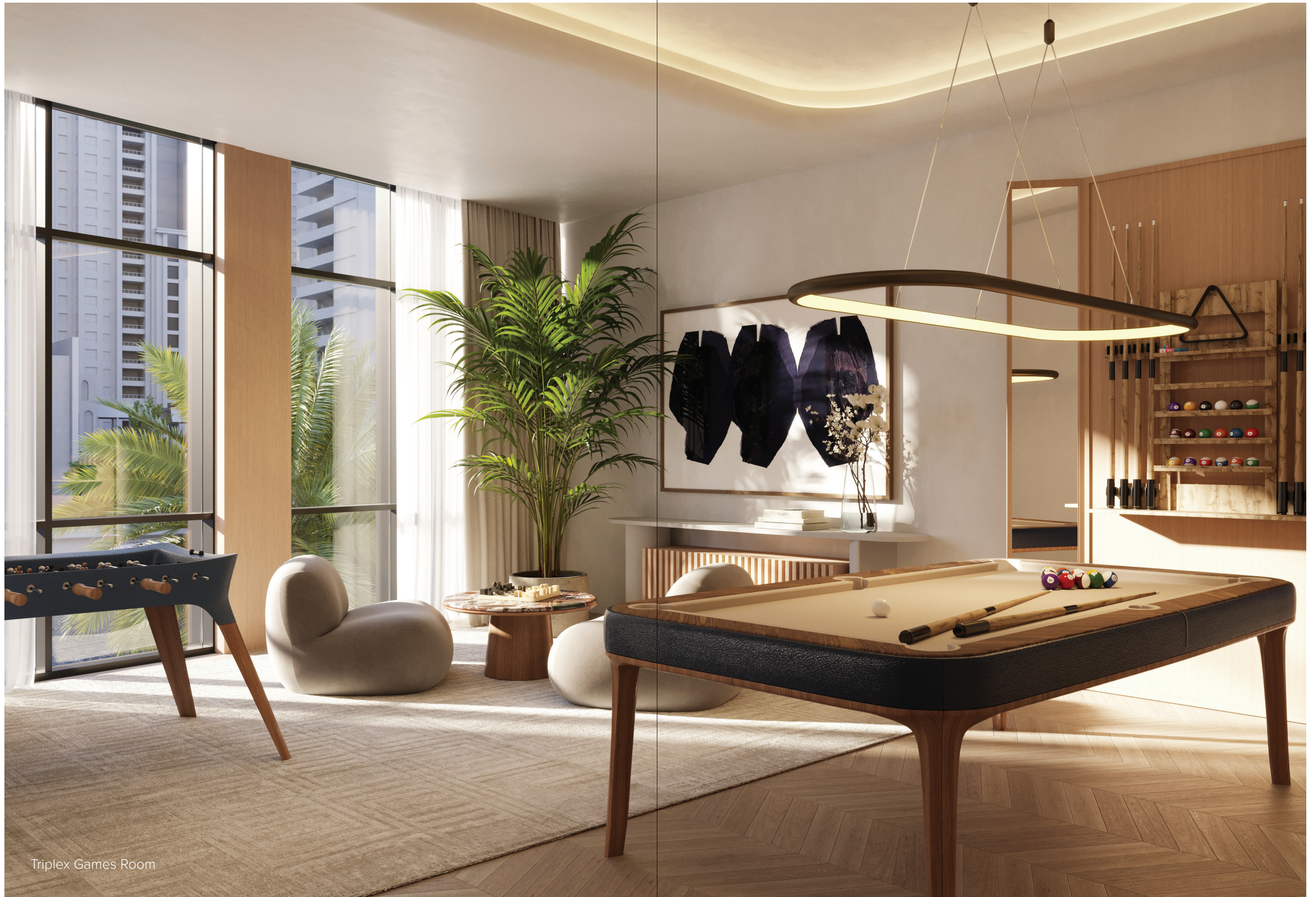
Triplex Games Room