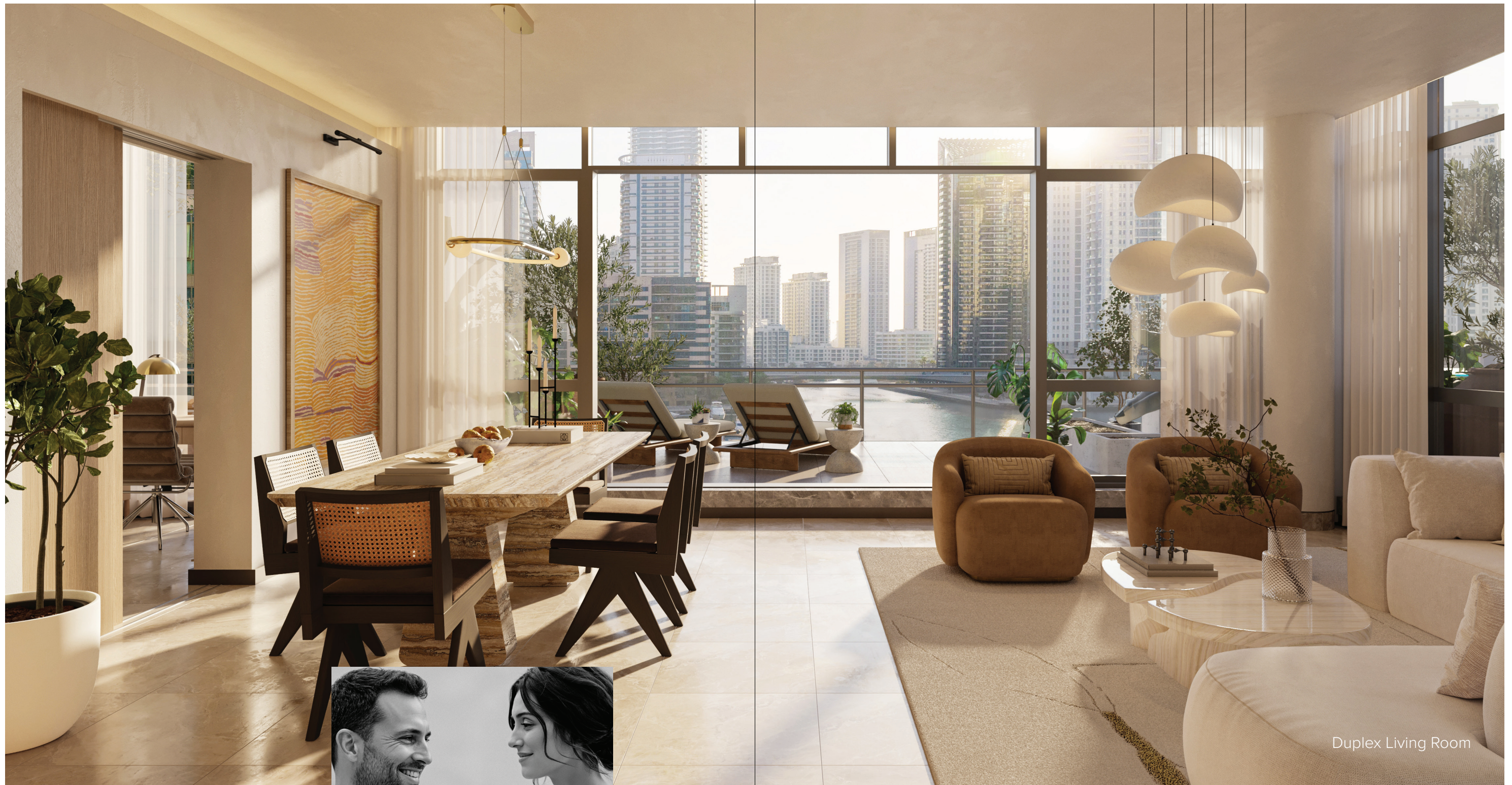
Duplex Living Room