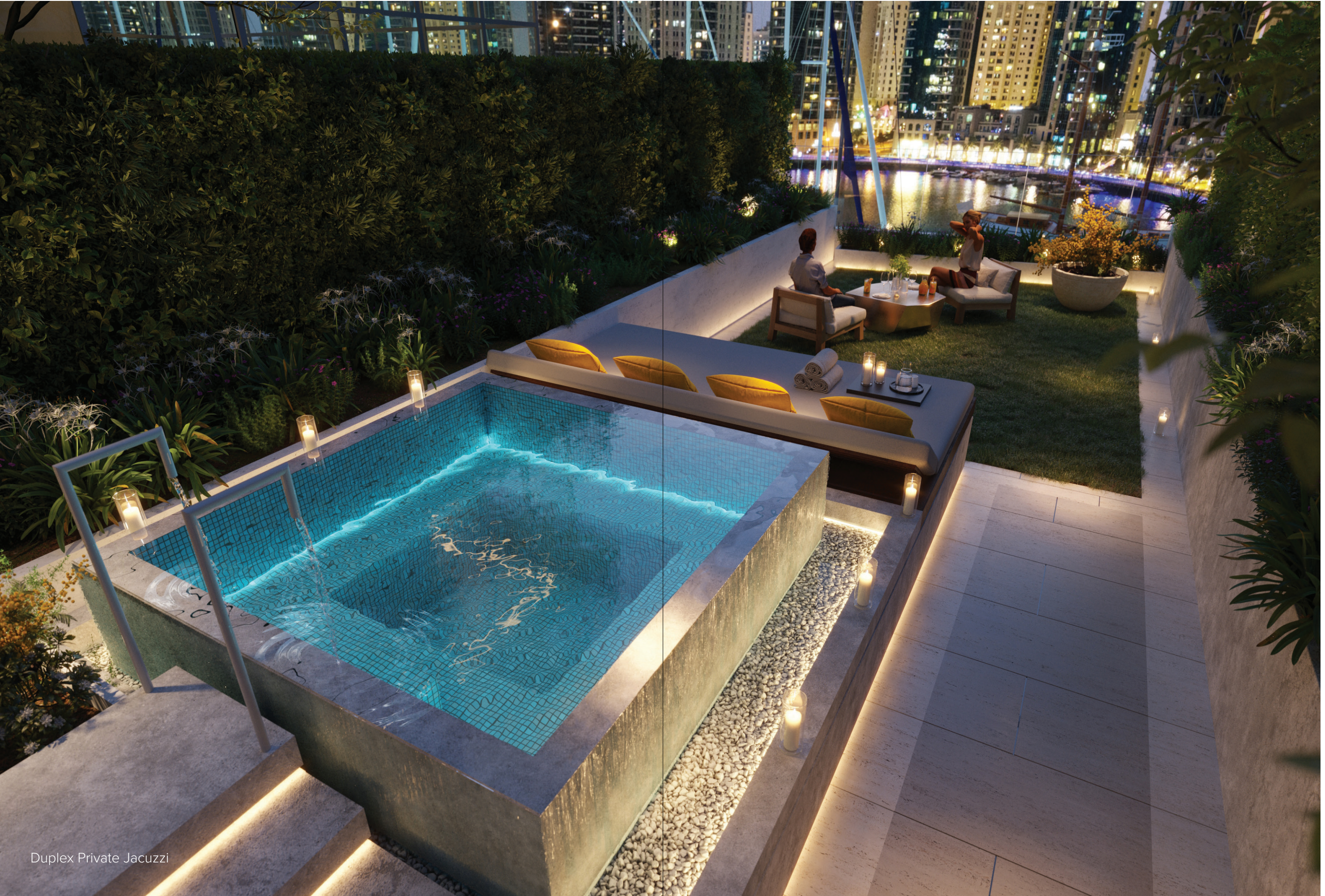
Duplex Private Jacuzzi