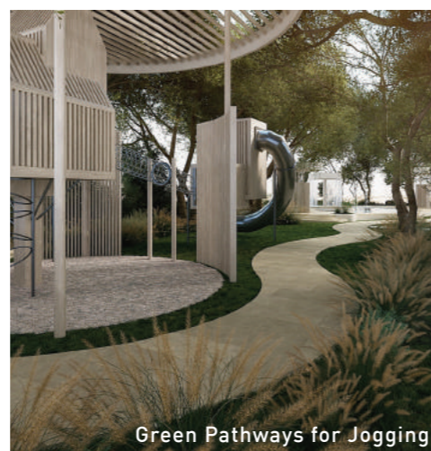
Green Pathways for Jogging