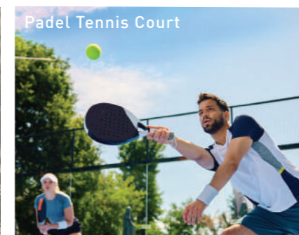
Padel Tennis Court